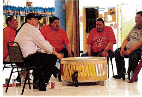
Singers at an April 2, 2011 event